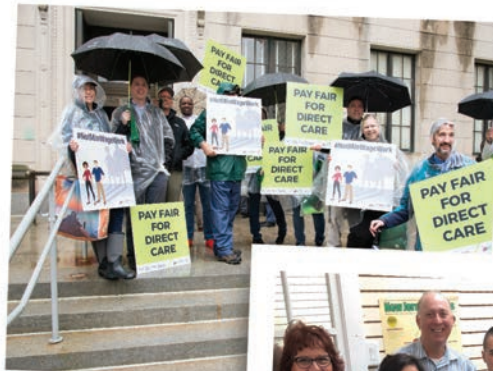
Advocating for fair DSP wages at the NJ Statehouse